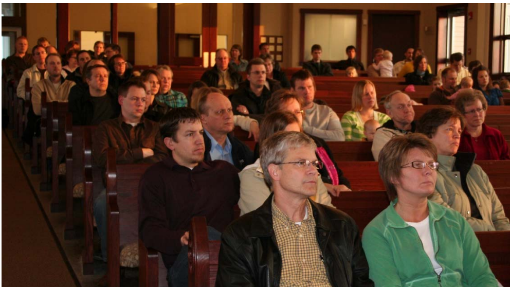
Photos: Parents' Evening at Rockford Church 3-28-2009

We will also enjoy a prepared meal and activities centered on our theme. Come and enjoy life in good company!